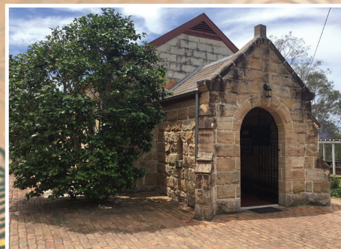
Ebenezer Church 1808 (oldest in Australia)