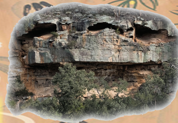
Wowame - (gigantic eel being) (watches over everything on the river)